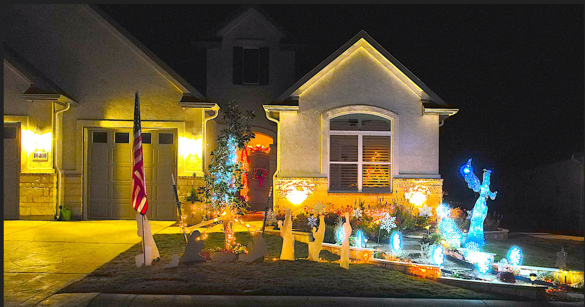
Lightened to bring out the manger. This was a well balanced display.